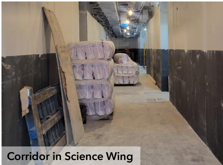
Corridor in Science Wing