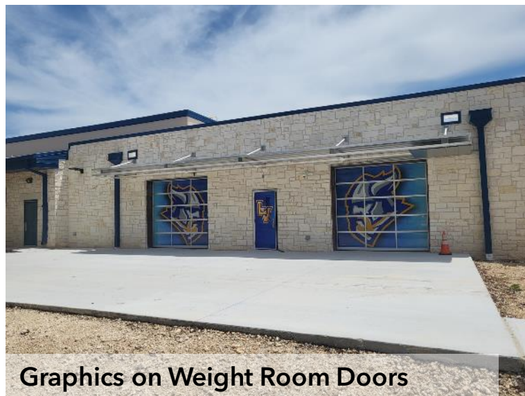
Graphics on Weight Room Doors