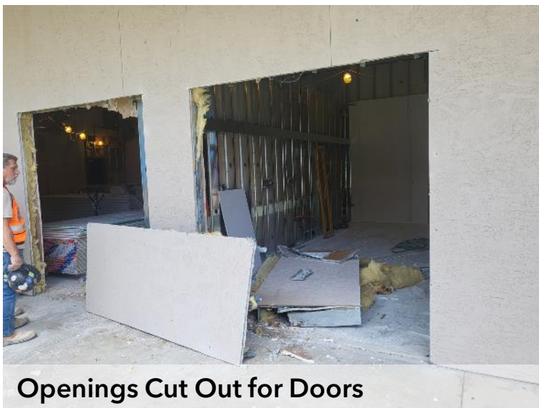
Openings Cut Out for Doors